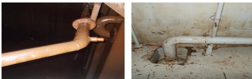
Oil sludge/residue cleaning in storage tank